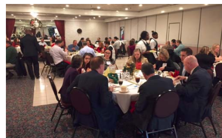
Members enjoying lunch