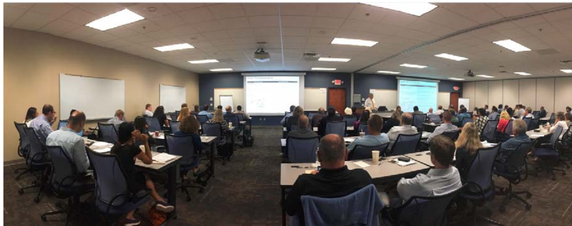
Participants at seminar

In this age of big data, fast data, Internet of Things (IOTs), cloud computing, server virtualization, etc., the expanding threat surface presents a growing risk. It's not practical to completely 'lock everything down'... and yet the open use of information can threaten an organization's existence.