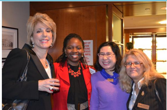
Board and Committee Members

New Member Update - The Chapter now has over 3,100 members. Chapter members who joined between November 1 and December 31 are now listed on our New Members webpage.