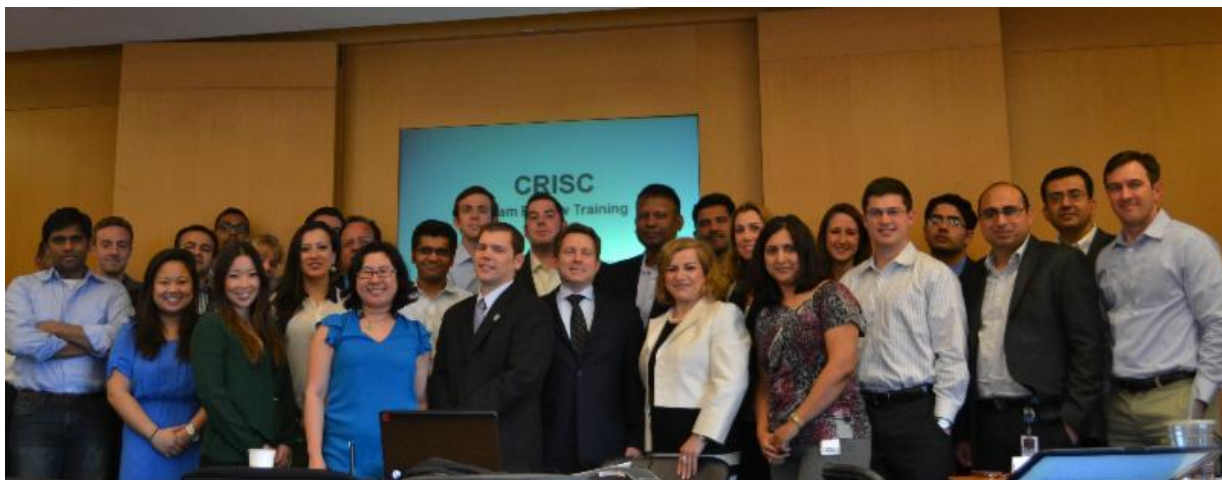
CRISC CLASS - SPRING 2014

Gain a new ISACA® certification this year!!! Registration for the September CISA and CISM exams is now open.